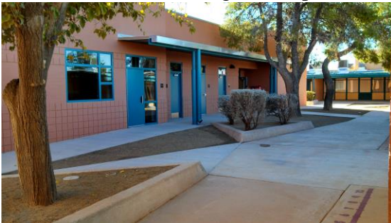
West Elevation – Main Entry