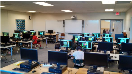
New Computer Lab Classroom