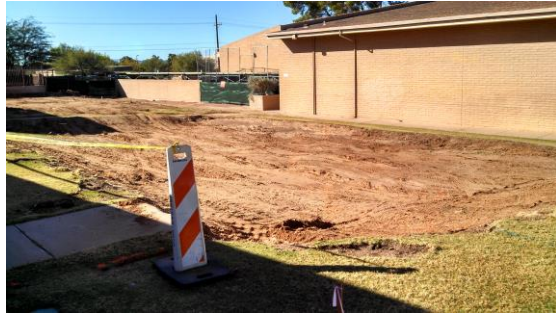
New Classroom Building Excavation

The Harelson project is on schedule and on budget.