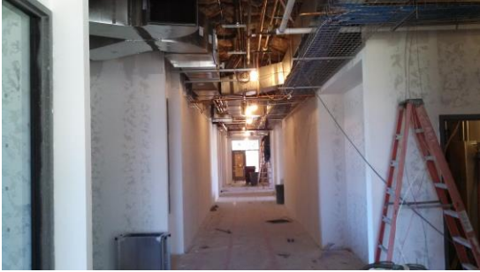
MP&E Above Ceiling Completion

New Classroom Building is in the finishes stages. Drywall is complete. Painting and interior finishes are in process.