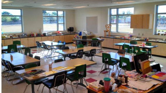
New Art Room