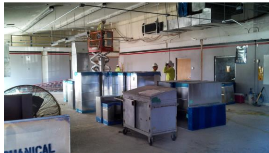
Overhead MP&E Rough-in

The building pad for the new weight room is complete. Excavation and footing installation is in process.