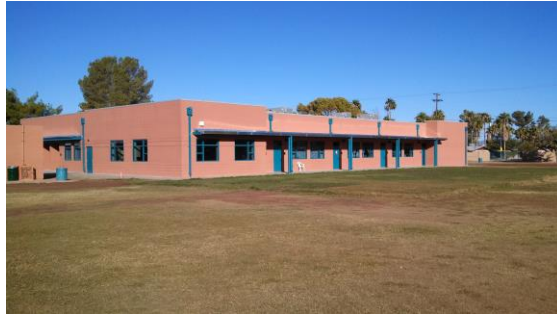
East Elevation – Facing Playground