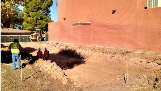
Music Room Excavation

Construction is 5% complete. Excavation and footing installation is in process for both the music room addition on the fun house as well as for the new classroom building.