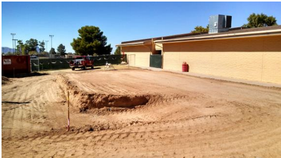
Weight Room Building Pad Prep

The Cross project is on schedule and on budget.