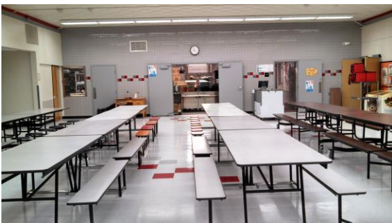
MPR Complete (new ceramic wall tile, new VCT floor tile, and repainted walls)